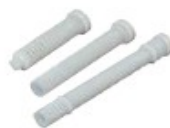
5", 7", 10" diffuser tubes