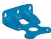
-S- wall bracket