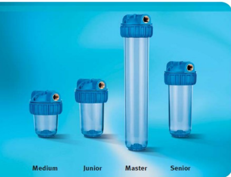
Medium Junior Master Senior