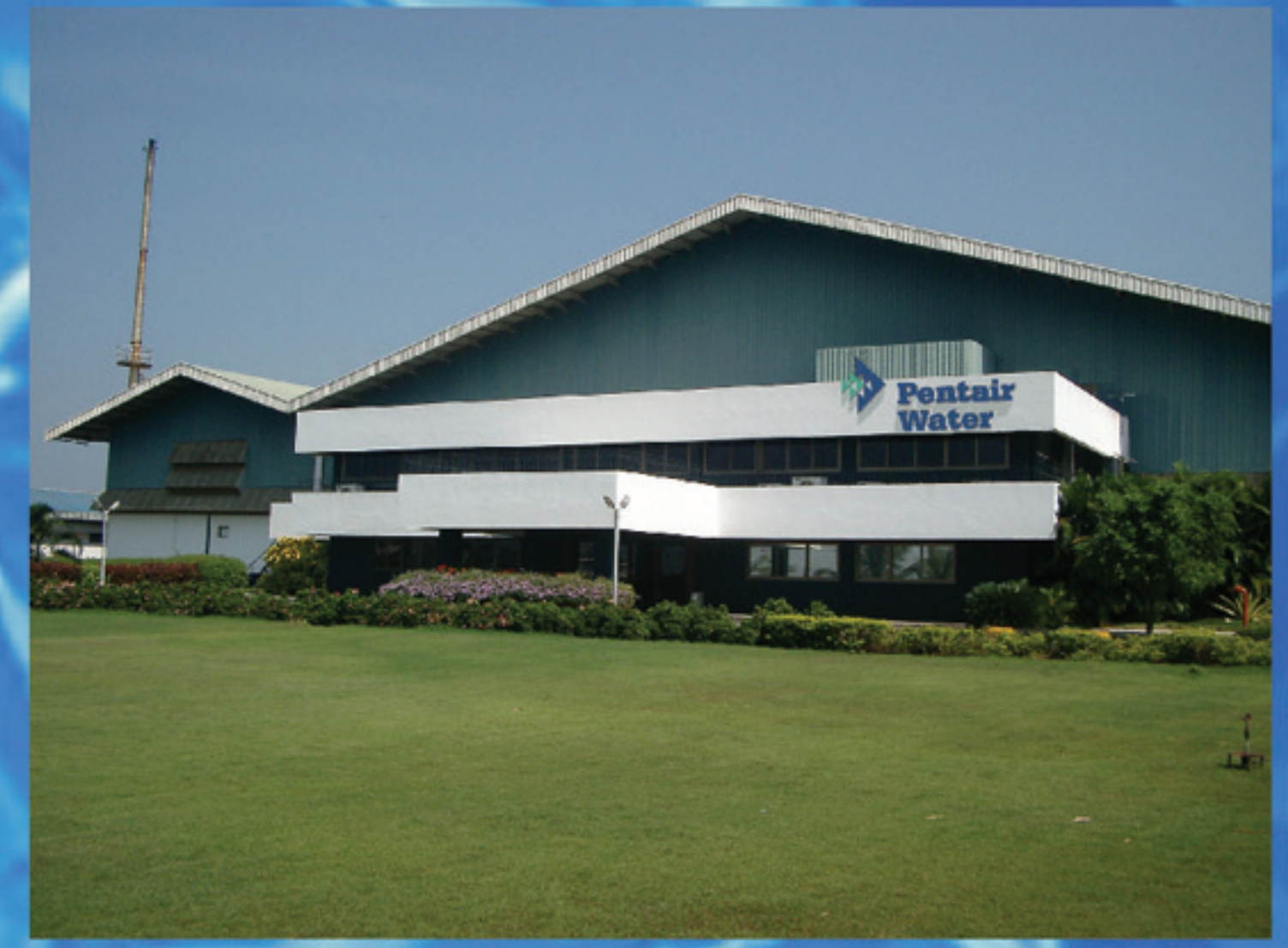
Manufacturing Facility, Goa India

CodeLine™ is committed to deliver continuous solutions that directly addresses customer needs. Since the first CodeLine™ Membrane Housing was introduced in 1976, we have been continuously shaping the water treatment industry with pioneering developments.